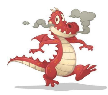
We can't possibly make a fundraiser any easier. Get decluttering!

LABELLING INSTRUCTIONS: All clothing bags MUST be labelled "Angus Morrison Elementary School" or the school will not get credit.